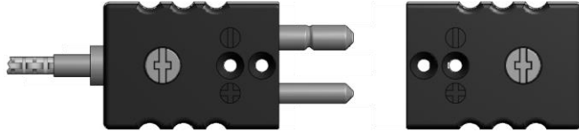
OPTIONS 4 OR 4,MC